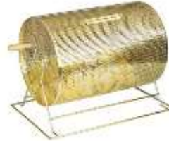
Small Brass Draw Barrel