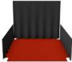
Underlay By Sq.ft