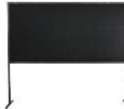
Horizontal Poster Board