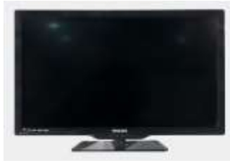
32" Flat Screen