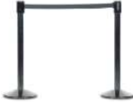
Stanchion with 7" Strap