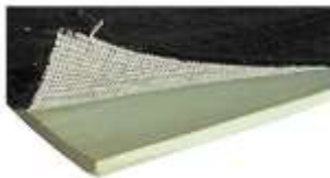
Underlay By Sq.ft